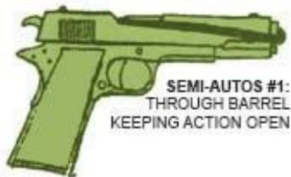
SEMI-AUTOS #1: THROUGH BARREL KEEPING ACTION OPEN