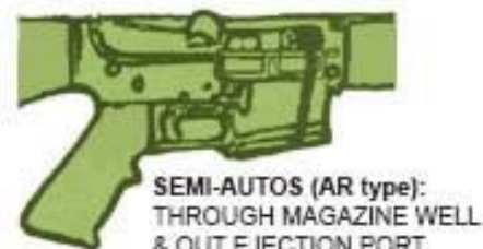
SEMI-AUTOS (AR type): THROUGH MAGAZINE WELL & OUT EJECTION PORT