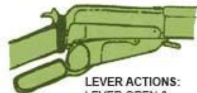
LEVER ACTIONS: LEVER OPEN & HAMMER DISABLED