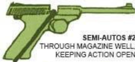
SEMI-AUTOS #2 THROUGH MAGAZINE WELL, KEEPING ACTION OPEN